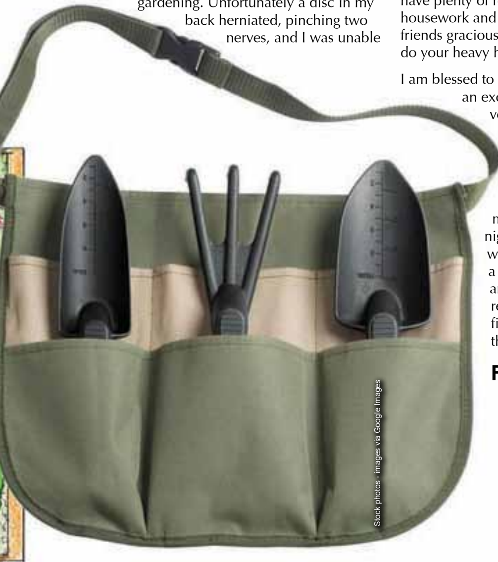
Stock photos - images via Google Images