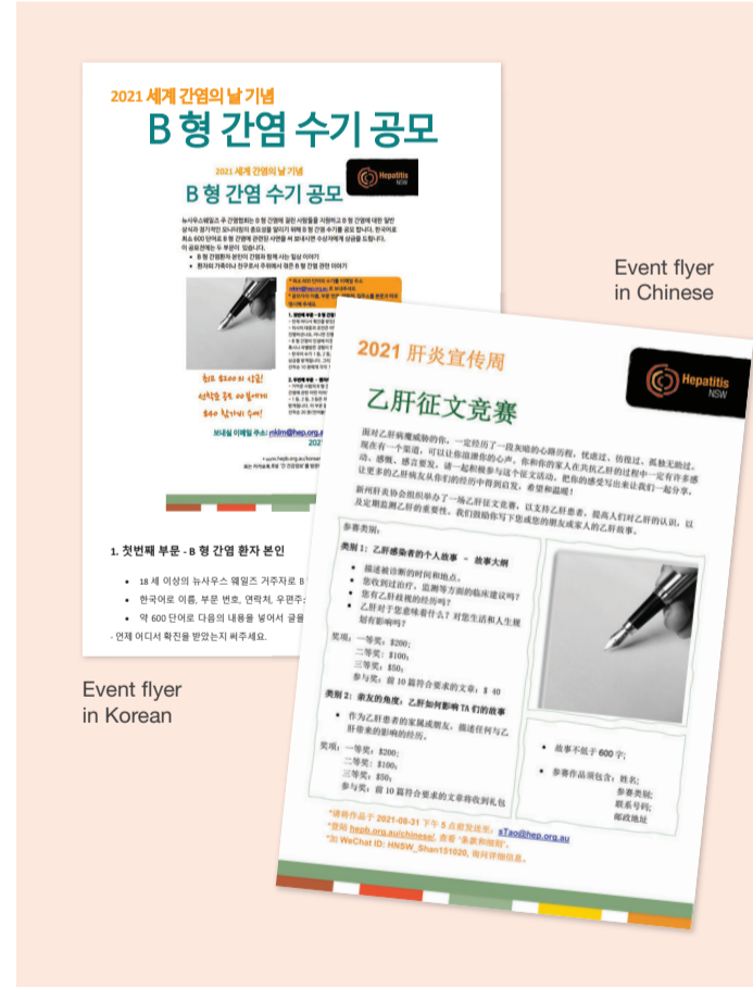
Event flyer in Chinese