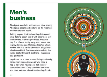
Yarnin’ about hep B layouts on: Men’s Business, disclosure and sex and hep C.