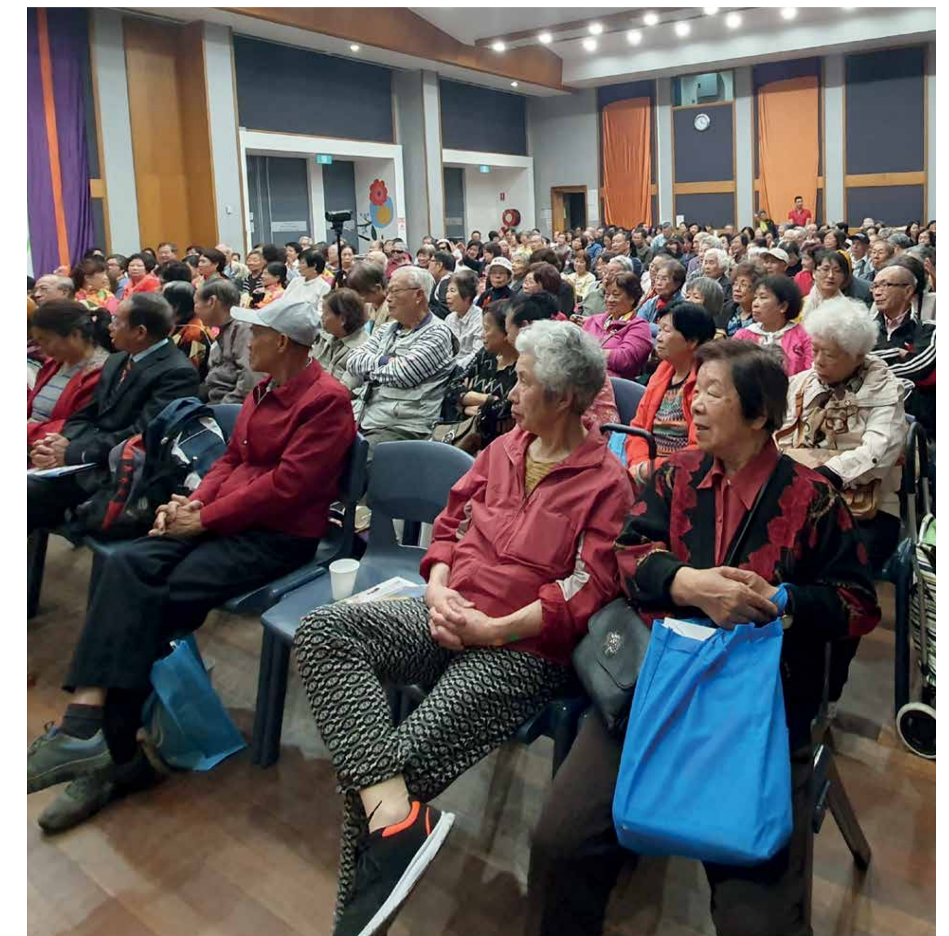
Chinese Seniors Health Gala at Ashfield Town Hall.