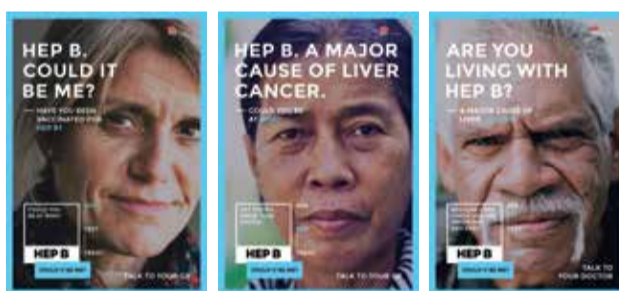
HEP B - Could it be me? [Messaging Matrix]