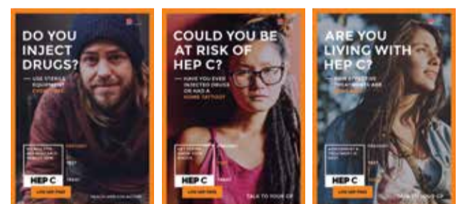
HEP C - Live hep free [Messaging Matrix]