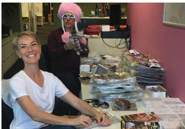
Packing day fun!