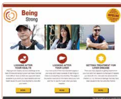
Being Strong - home page

Although not an online website, Being Strong still utilises a website format, design and navigation elements.