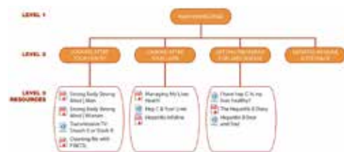
Being Strong - site structure

Three primary areas of the site - Health, Liver and Treatment - contain various related resources, PDF and video files.