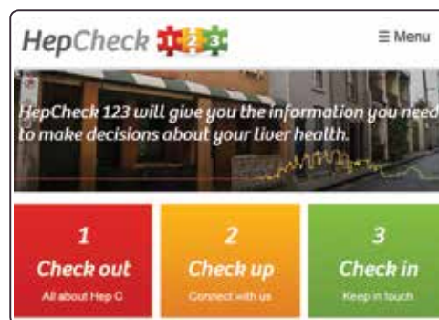
Image: screen shot of HepCheck 123 website home page www.hepcheck.org.au

HepCheck 1-2-3 is a pioneering project in the homelessness space and a model for effective collaboration and communication in providing appropriate and effective hepatitis healthcare to people affected by homelessness.